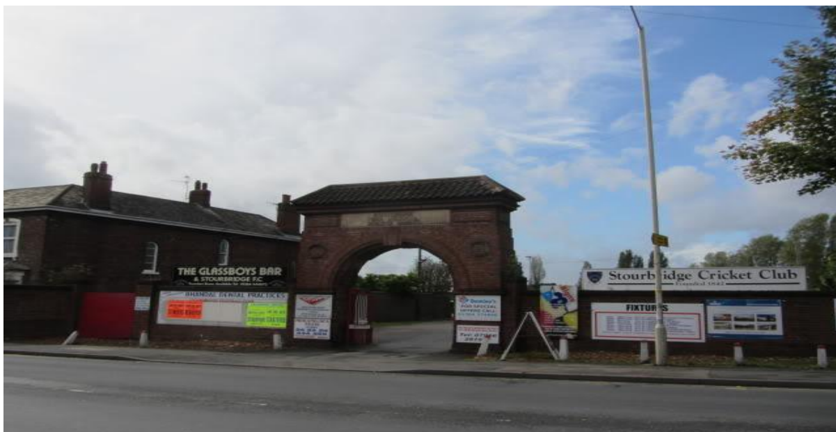
Entrance to the ground

Train to Stourbridge Town Railway Station then it's a 14 minutes' walk to the ground from the station turn right to go on to St Johns Road then follow the road to the roundabout and continue up to Vicarage Road the ground is on the left you cannot miss it (See below)