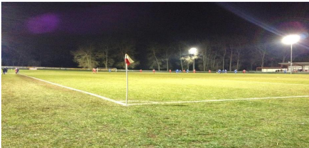
Ricky By south

Train to Northwood Hills Underground Station then take a left walk up to the roundabout take a left and at the next left turn into the ground at the car salesroom walk under the bridge and its 100 yards on the left.